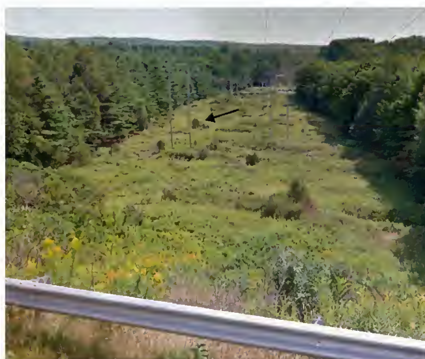
Fig. 8. Google Earth 'street view' of power-line near Bingham, ME. Arrow points possible J. c. var. communis tree.